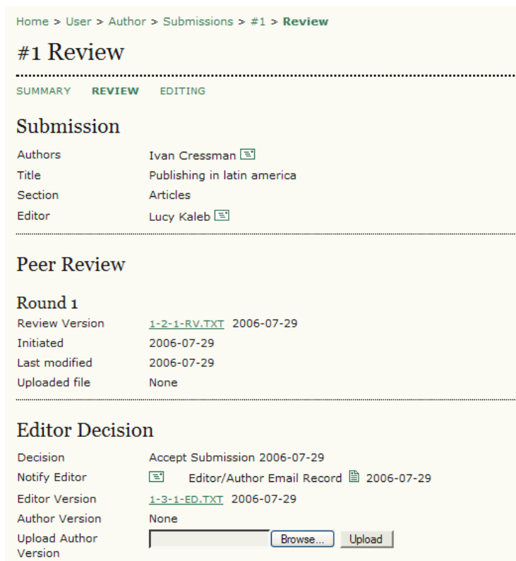
Figure 14: Following the review process

From here you can read the reviewer's version and the editor's version. Read or submit comments using the "Editor/Author" icon. Use the file upload tool to submit any changes for your article.